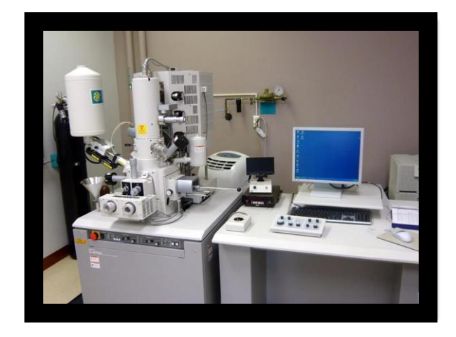
Fig 7: Scanning Electron Microscope