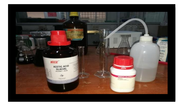
Fig 4: Chitosan and Acetic acid