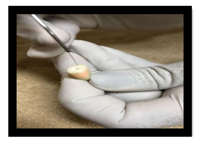
Fig 6: Diode Laser used for agitation of irrigant