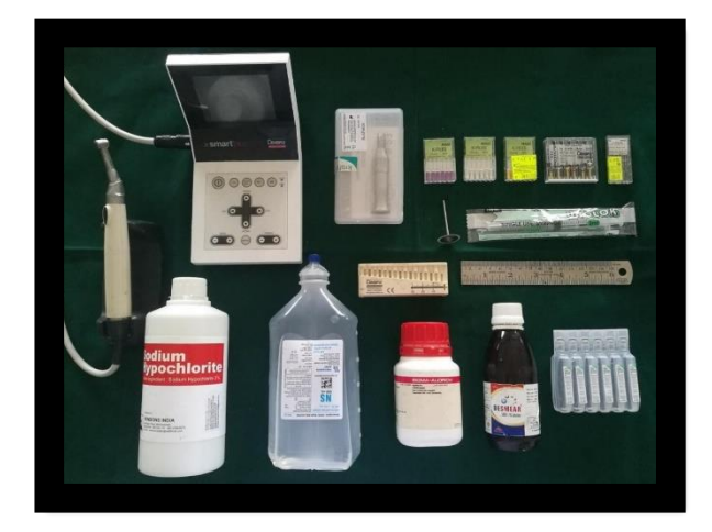
Fig 3: Armamentarium