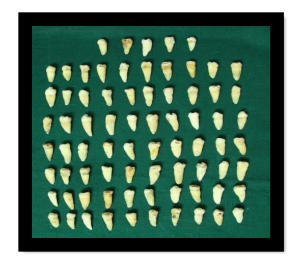
Fig 1: 75 Single rooted mandibular premolar