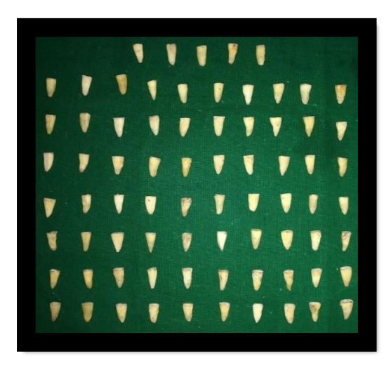
Fig 2: Decoronated samples